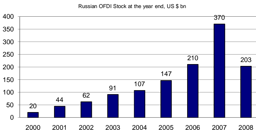
Figure 2 Russia's OFDI stock, 2000-2008

Between 2000 and 2008, the Russian OFDI stock grew more than tenfold, amounting to $ 203 billion, by the end of 2008 (Figure 2). Without the deteriorating effects of the global financial crisis, the figure would be substantially higher (standing at $ 370 billion in the end of 2007). The 2008 drop was mainly due to negative valuation changes of Russian companies' foreign assets, amounting to $ 220 billion in 2008. The actual value of new OFDI transactions from Russia increased to $ 53 billion in 2008. Hence, Russia stands out as one of the few economies posting growth in OFDI flows amidst the global economic crisis.